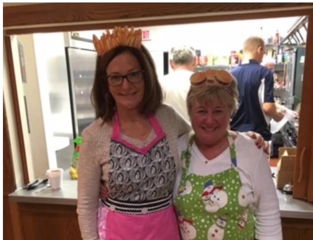
Enjoying the season

Applications are NOW available online and are due on February 3, 2017 at 11:59 AM Central Time. For more information about eligibility requirements and to access the online application - visit enf.elks.org/leg