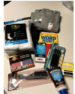
Santa visits the lodge during Kids Christmas Party. Right: Some of the donations made to Hastings Veterans Home for Christmas Stockings through our ENF Freedom Grant. Below: Some of our fabulous volunteers helping out during Holiday Stroll