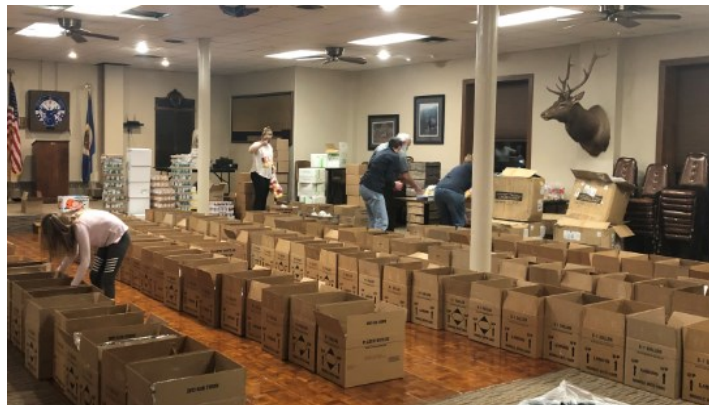
BE PROUD!! 125 Food Baskets delivered thanks to our members and local businesses!!

Also watch for an update from Trustees on some work done this fall thanks to an HRA Loan to fix some roof damage, take care of some fire protection requirements & several other improvements to our lodge!