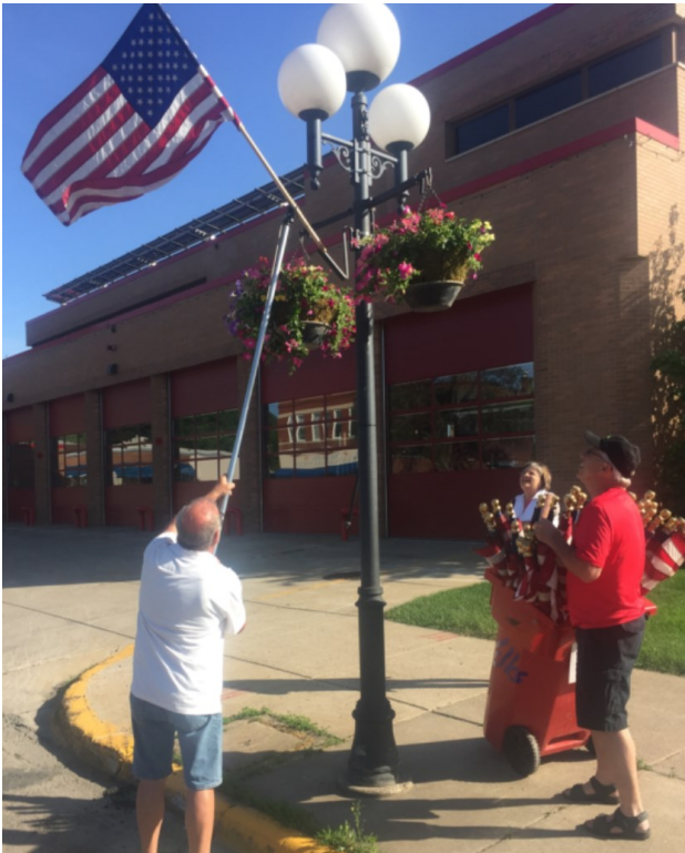
Putting up flags for Memorial Day!

PLEASE don't wait to be asked . . . We need all the help we can get!