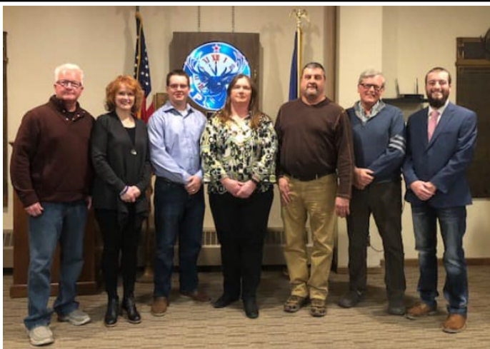
New Members initiated in February