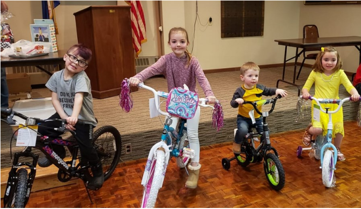
Bike winners at our Kids Easter Party