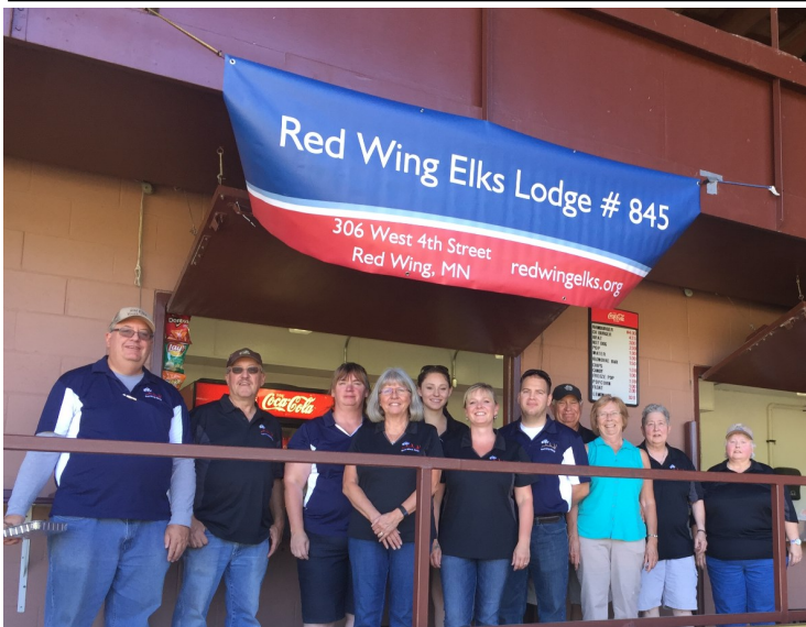
Guns & Hoses Volunteers