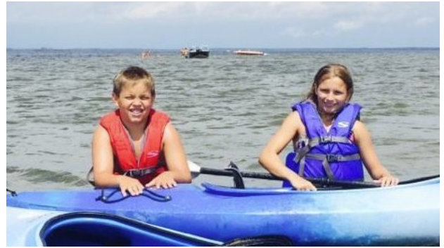
ELKS CAMP FUN 2015