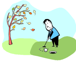
Red Wing Elks Lodge #845