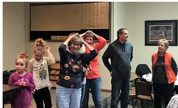
Heads or Tails fun during Turkey Games sponsored by the RW PER's