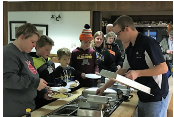
Holiday Stroll Breakfast Yummy pancakes, sausages & eggs