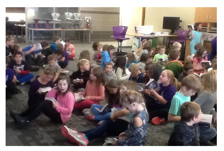
DICTIONARY PROJECT - Thanks to the RW Elks, 150 kids in the Ellsworth School district enjoyed receiving a Reference Dictionary and will continue to use it throughout the school year!!!