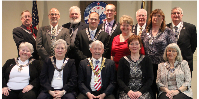
2016-2017 Lodge Officers