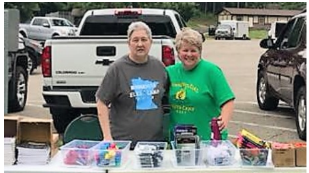
Through an ENF Grant, RW 845 provided School Supplies to local Military families

Elks What are the benefits of your membership