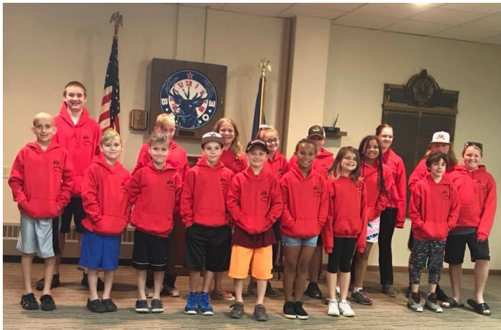
RW 845 sent 17 kids to MN Elks Youth Camp during the week of June 17-23